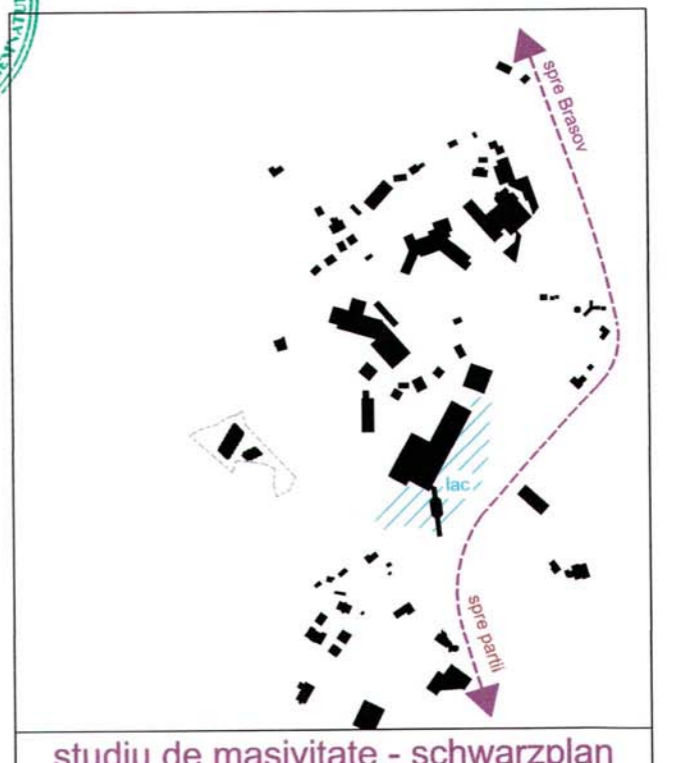
studiu de masivitate - schwarzplan